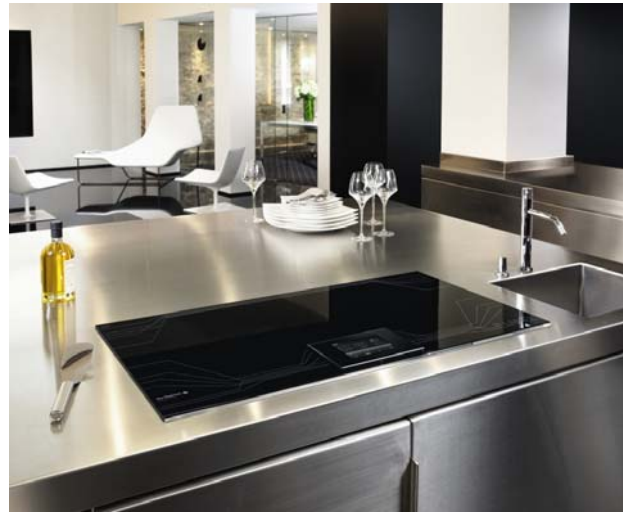
DE DIETRICH DTiM1000C 93CM INDUCTION HOB THE PIANO ULTIMATE COOKING FREEDOM

De Dietrich is renowned for groundbreaking concepts in kitchen appliances and was the first brand to introduce induction hobs to market in the 1980's. Over the following decades the company has continued to research and develop ever more sophisticated technologies to advance the induction concept and was the first to introduce zoneless technology in 2007 with the Continuum hob. Today, De Dietrich is proud to launch The Piano; the world's most advanced zoneless induction hob which delivers ultimate cooking freedom.